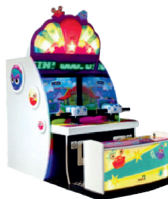
SEA - WORLD