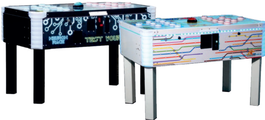
CATCH THE LIGHT