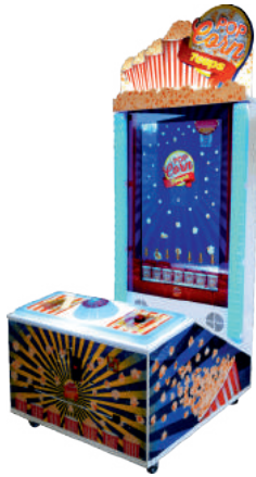
POPCORN 7 CUPS