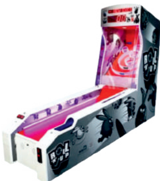
ALLEY BOWLER - ROLL