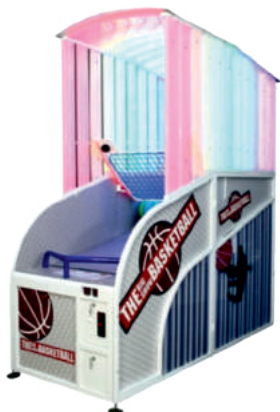
THE BIG SNOW